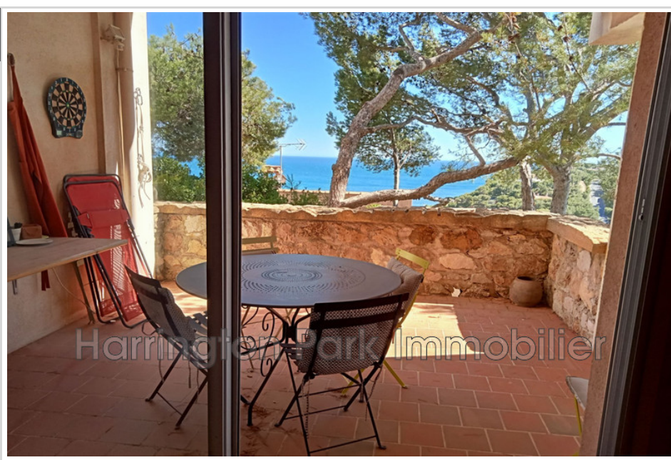
Apartment Carry-le-Rouet ref. 830V22A - Mandat n°624